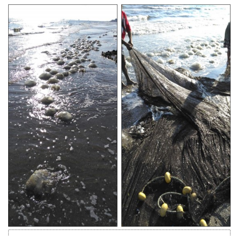
Figure 3. Collecting dispersed medusae of R. nomadica from Port Said coast by beach trawling net.