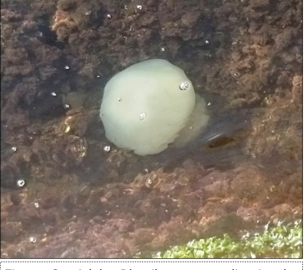
Figure 2. Adult Rhopilema nomadica in the Mediterranean coast of Egypt.

Bell diameter of the measured specimens ranged between the minimum of 21 cm and the maximum of 112 cm. The average bell diameter for each year displayed gradual increasing values over the years from the lowest average of 42.1 \pm 7.78 cm in 2015 and the highest average of 46.26 \pm 13.03 cm in 2017 (Table 1). In 2015, most of individuals released their gonads (76%), this was inverted in 2017 when only 30% of the investigated medusae shed their gonads, while in 2016 about half of medusae (48%) were empty from gonads (Table 1). Sea surface temperature (SST) ranges throughout three years were 25-31 °C in 2015, 24-33°C in 2016 and 29-38°C in 2017 (Table 1).