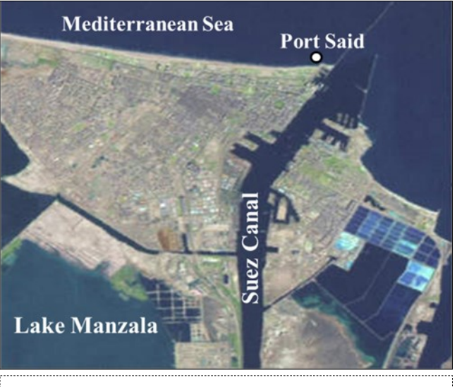
Figure 1. Egyptian Mediterranean off Port Said coast

The outbreak of R. nomadica in the eastern Egyptian Mediterranean off Port Said coast (31° 16' N, 32° 19' E) (Fig. 1) was monitored during blooming period (summer season) of the three consecutive years (2015 to 2017). Dispersed medusae of R. nomadica were estimated every couple of days at a distance of 1 km inshore using fishermen beach trawling net, with