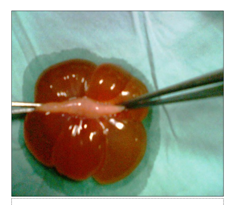
Figure 1. Fetal Abdominal Mesentric Lymphangioma along with part of jejunum.