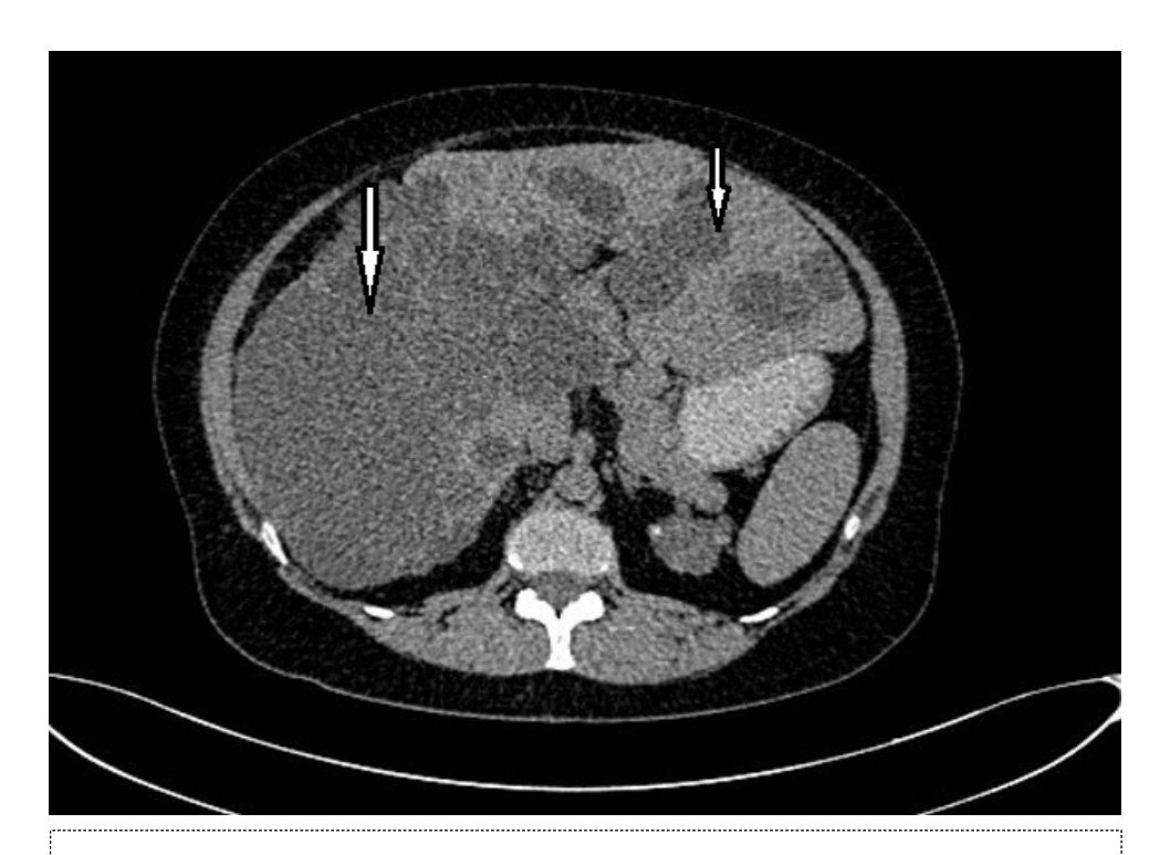
Figure 2. Non-contrast CT shows multiple liver cysts with variable size and multiple renal cysts.