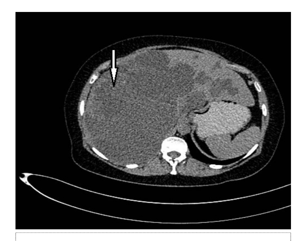
Figure 1. Non-contrast CT shows hepatomegaly by multiple clusters of cysts.