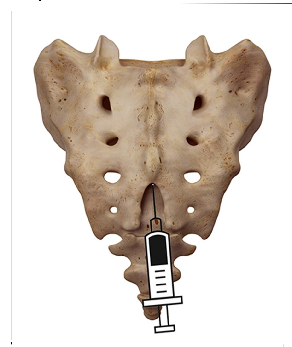
Figure 1. posterior view of the injection in the hiatus.

procedure. If lower back pain persists after a sacral injection, alternative treatment options should be discussed with a healthcare provider.