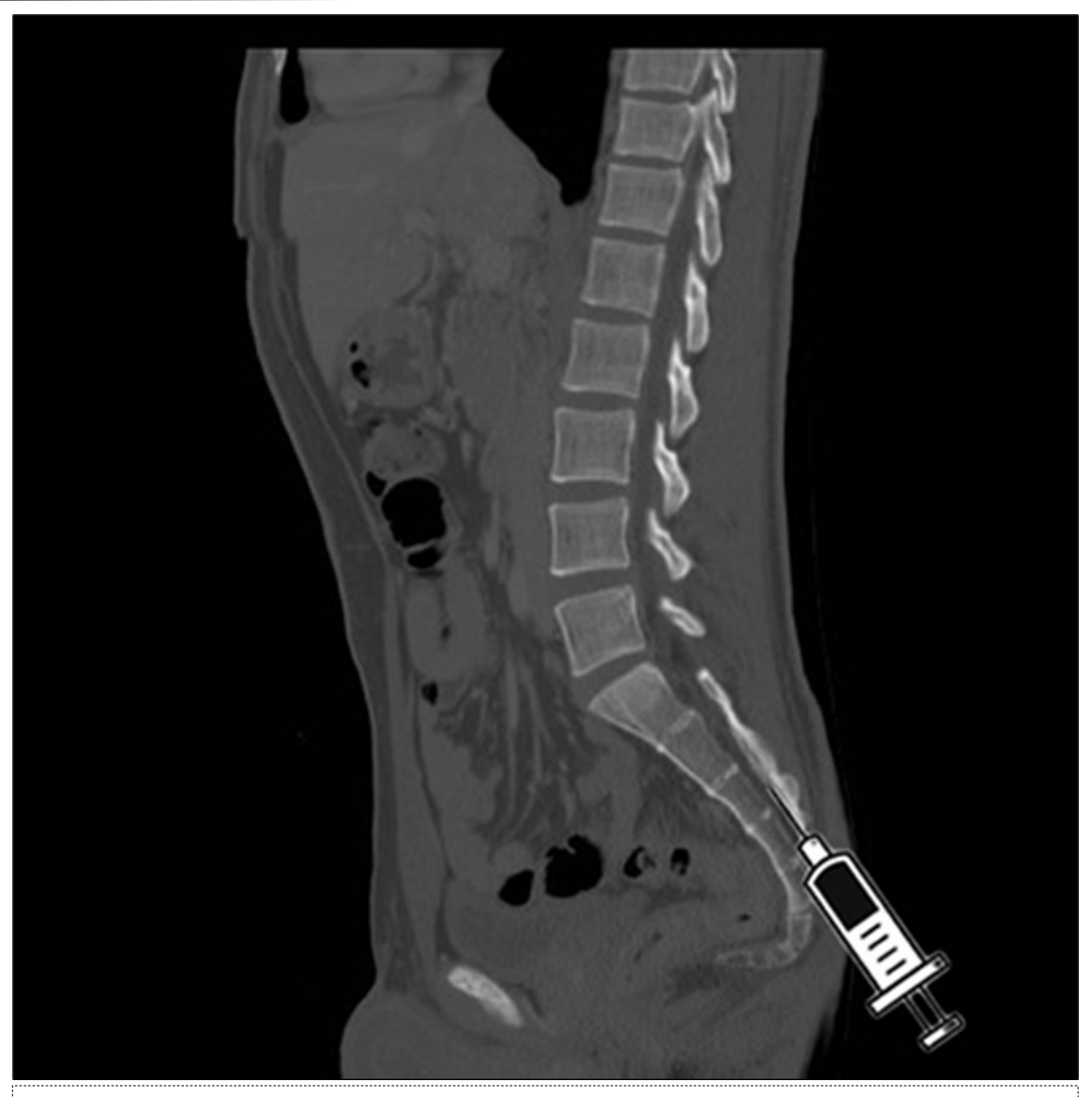
Figure 3. sagittal C.T. scan view of the injection in the hiatus.

additional injections or alternative treatments can be considered based on their specific needs and circumstances.