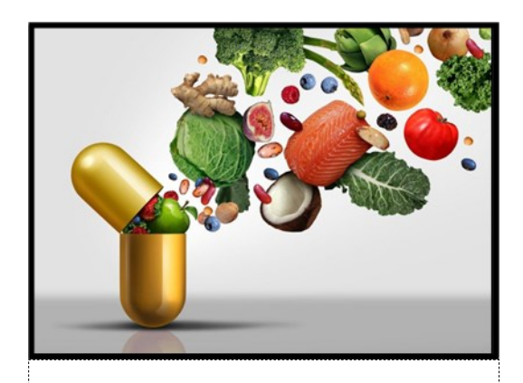
Figure 1. Nutraceuticals [14]

Nutrition (essential for health) + Pharmaceuticals (treatment of illness/injury) = Nutraceuticals (in preventative medical approach). [13]