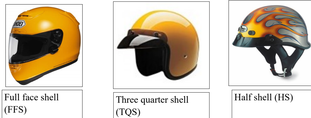
Fig. 1. The pictures of different helmet designs used by the riders in the present study

into a computer and again double checked for errors and completeness. The injury severity scores based on FISS were categorized: 1 = score 1-6 and 2 = score > 6. The data were analyzed using Statistical Package for Social Sciences Inc., (SPSS version 17.0 for windows, Chicago, Illinois, USA). Frequency distribution was used to summarize the data. Chi-square statistics was used to assess any significant differences in participants based on quantitative variables. Paired t test was used to assess the intra-examiner reliability in recording observations. The level of significance was set at p value <5%.